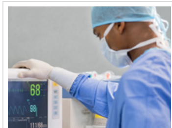
Anesthesiologists use digital devices to monitor patients' vital signs throughout surgery.

Until recently, we knew very little about how anesthetics work. Scientists are now able to study how the drugs affect specific molecules within cells. Most researchers agree that the drugs target proteins in the membranes around nerve cells. Because inhaled anesthetics have different effects than intravenous ones, scientists suspect that the two different types of drugs target different sets of proteins.