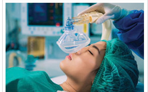
Every year, millions of Americans safely undergo surgery with anesthesia.

Depending on the type of pain relief needed, doctors deliver anesthetics by injection, inhalation, topical lotion, spray, eye drops, or skin patch.