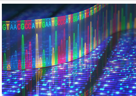
The ability to determine the precise order of bases that make up DNA is speeding biomedical research.

DNA is shaped like a corkscrew-twisted ladder, called a double helix. The two ladder rails are referred to as backbones, and the rungs are pairs of building blocks called bases. Humans have about 3 billion base pairs in each cell.